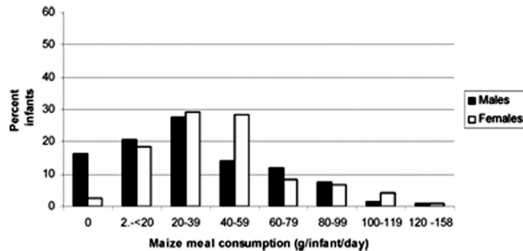
Figure 1. Distribution of infants consuming maize at different amounts per infant per day by sex.